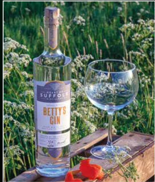
Betty's Gin Label: Printed on a textured wine paper substrate, with hot silver foil and embossing using the ABG digicon series 3.