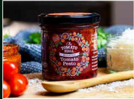
The Tomato Stall, Pesto Label: Printed in CMYK + white using the Xeikon CX300 on a clear PP material.

Working closely with businesses across the country, we print high quality labels in different size quantities and have even supplied high profile events such as the London Olympics. We are committed to providing the best possible service and at the same time to remain conscious of our environmental impact, looking to reduce our footprint as much as possible.