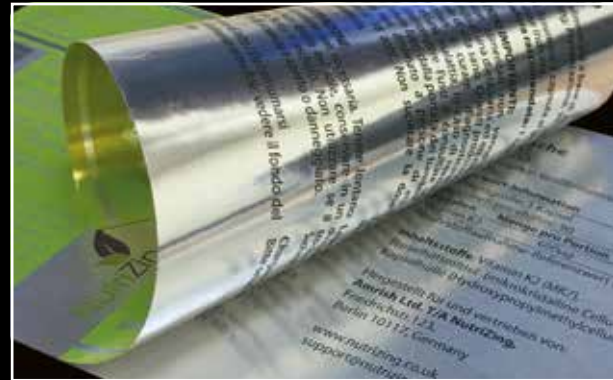
Nutrizing Vitamin K2: A 2 ply Peel & Reveal label created using our MPS EF340 flexo press, printing 3 pages of full colour print on a silver PP Substrate.